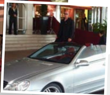
Pro-TECT staff Photos from top: Britain's got talent studios; High Profile Babyshambles gig with front man, Pete Doherty requiring a six man team in and around the venue; Red Carpet Security for The World Music Awards with Ringo Star; Actor, Cuba-Gooding Junior and Pro-TECT security in Cannes.